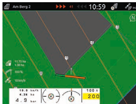
The reference lines are numbered. Disabled boom sections are marked in orange.