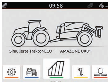
The user selects a feature from the app carousel. It's easy and fast.

N ew features include automatic, GPS-based field detection, creating job reports in PDF format, help windows and multi-layer application maps for variable-rate spraying of various products. Also the GPS-Track feature was improved so operators can now nudge waylines that have shifted due to GPS drift by pressing a single button – just as they could on the AmaTron 3. The latter wasn't possible on the early AmaTron 4 we operated in the UX 4201 Super.