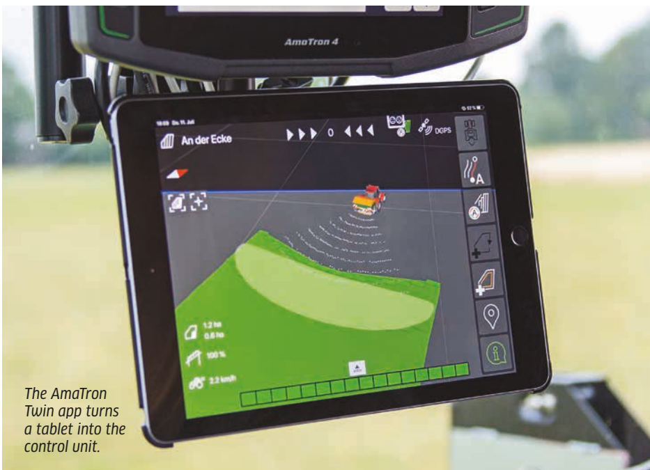
The AmaTron Twin app turns a tablet into the control unit.