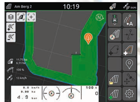
GPS-Track records bouts, boundaries (blue) and any obstacles.

The new terminal not only operates ISObus-compatible machines, but it also offers a number of Amazone-specific applications: GPS-Track (£1,015), 'GPS-Switch basic' section control (£1,015) and 'GPS-Switch Pro' (£750), 'GPS-Maps and Doc' field and geo-referenced documentation software is free, whilst the automatic 'AmaCam' reverse-drive system costs £225.